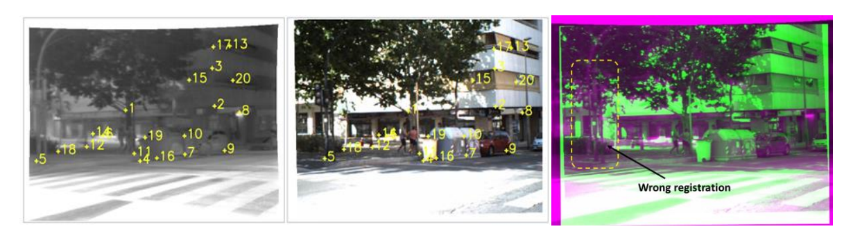
Fig. 1. Registration of LWIR and VS images. (left) LWIR image with the set of keypoints (20 points); (middle) VS image with the corresponding keypoints (20 points); (right) Registration result obtained by minimizing MSE (this figure is best viewed in color).

that of the target image ( I_T ). Figure 3 (left) and (middle) show LWIR and VS images of the same scene; the MI based registration result is presented in Fig. 3 (right). Like in the previous section, input images are overlapped using different colours to qualitatively appreciate registration results. Unfortunately, there is not a ground truth to quantitatively evaluate the accuracy of the results, but in general the registration obtained with MI is considerably better in comparison with the one obtained with the feature based approach.