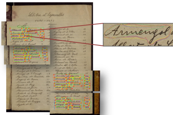
Figure 2: Illustration of the segmentation result.

The recursive split up strategy presented above has shown advantages with respect to initial attempts where the user received the whole page to segment the words. Firstly, the simplicity of the task allows an easier and faster fulfillment. Secondly, having the task atomized as small pieces of work, although seems to increase the amount of tasks, it allows the parallelization in the solution, and then faster results are obtained. On average, all the words from a given page were extracted in 9 minutes, while by using the software mentioned above, it required 20 minutes per page on average. No redundancy was applied in both experiments, each final word was segmented only by one user. The experiments were conducted by different persons using both platforms.